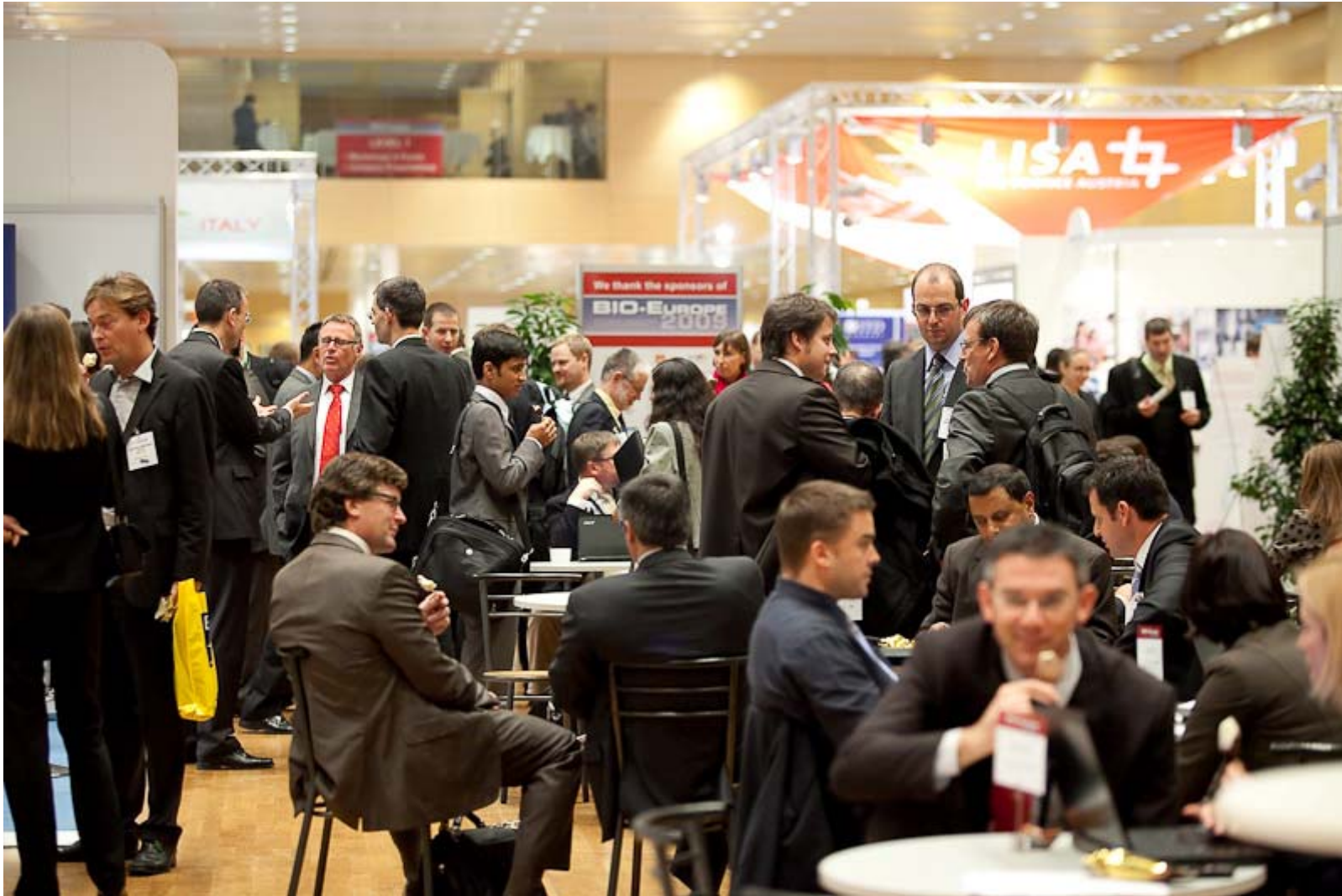
Nr 3 Exhibit Hall