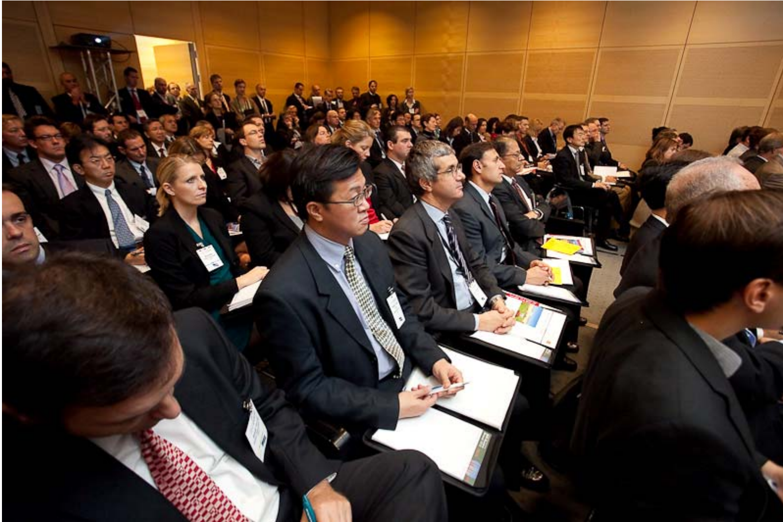
Nr 1 - Sessions Workshops, Panels and Company Presentations were very well attended