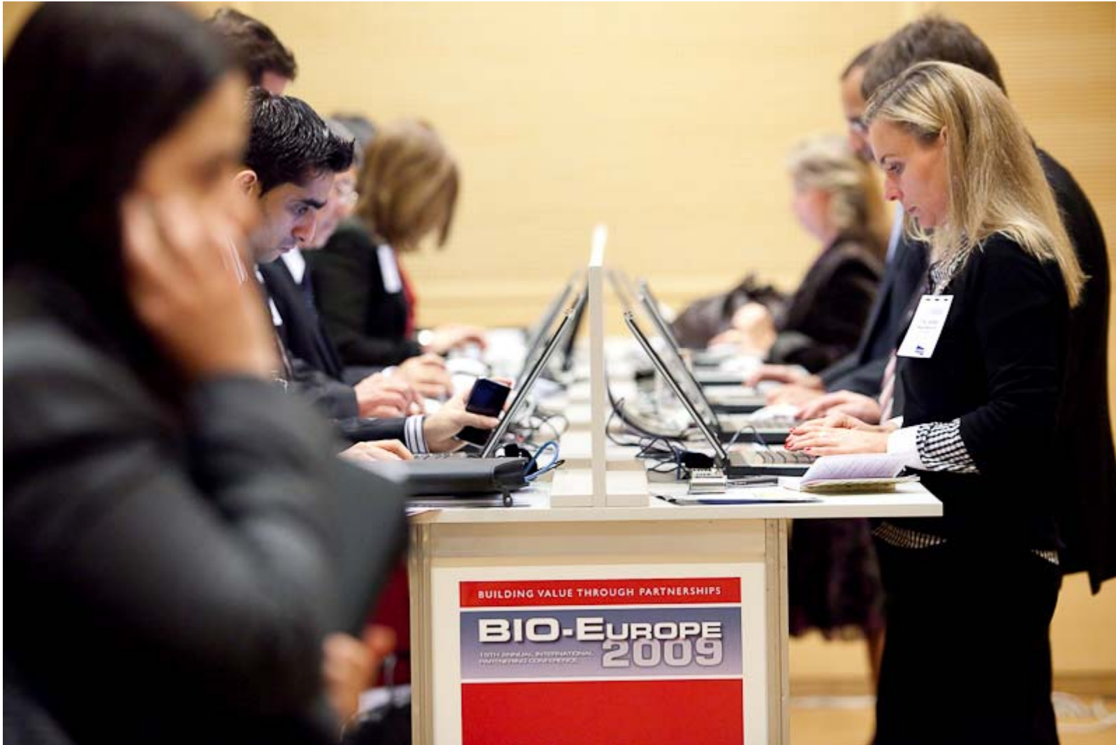
Nr 4 Partnering Terminal in Exhibit Hall: Access to online partnering software partneringONE® to manage meeting schedule