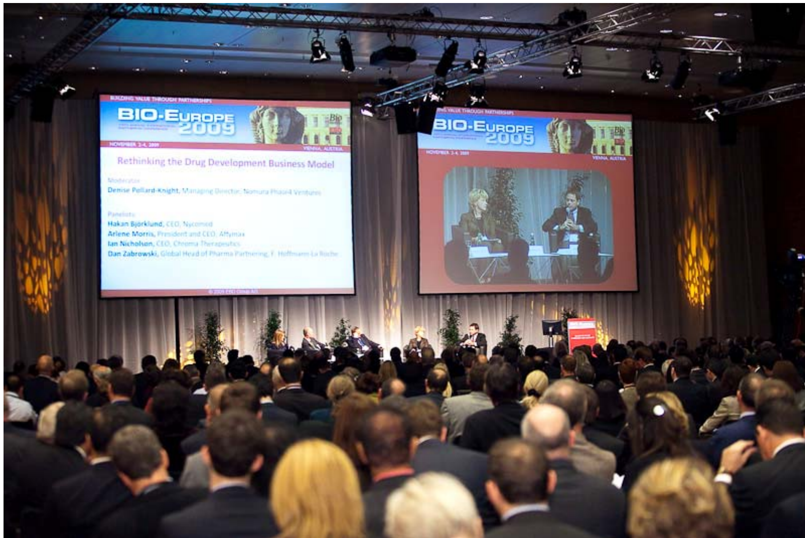
Nr 2 Opening Plenary Session: "Rethinking the Drug Development Business Model"